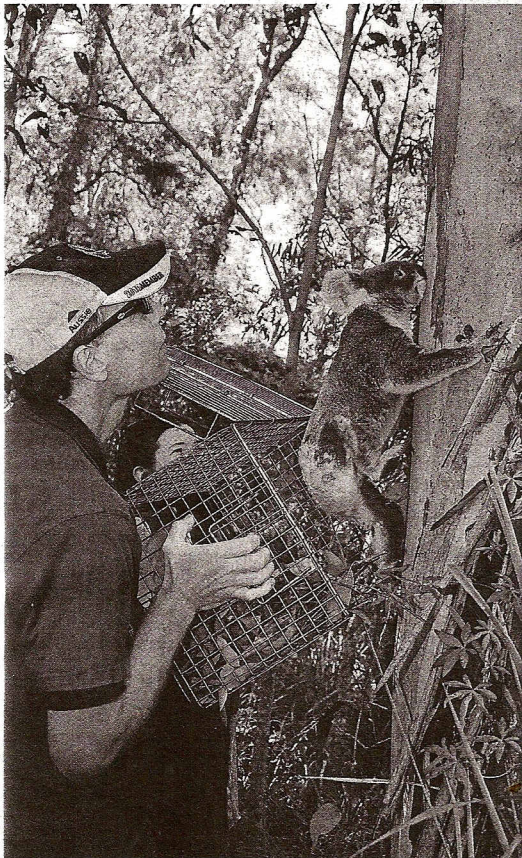
OFF YOU GO: Murray Chambers releases Lesley the koala.